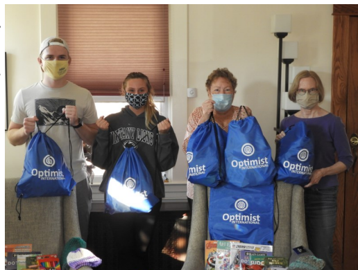
Guess who's behind these masks?