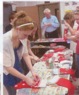
(Above) TU Optimists prepare stockings for the families at the Believe in Tomorrow Children's House at Johns Hopkins.