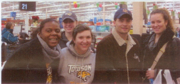
(Right) TU Optimist Club members at Shop with a Cop!