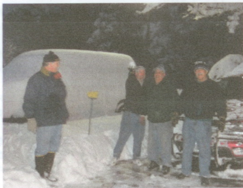
The snow crew had a fun time cleaning nine cars in the parking lot.