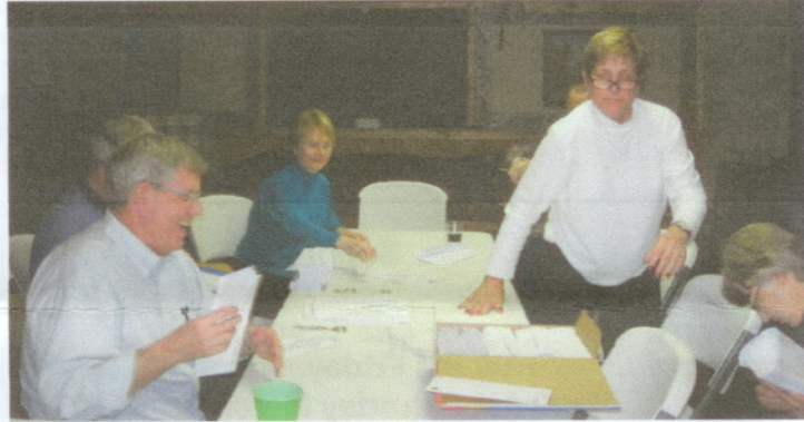
Following dinner, GJOC Optimists prepared the packets for the Stock Market Challenge 2010 mailing to previous participants and Club members. A fun time was had by all.