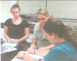
TU Optimist Club Treasurer writes receipts for new member's dues.

Dues: $35 for the year or $20 per semester are due before October 30, 2010