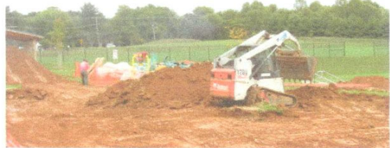
↑ Breaking ground .