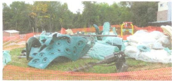
↑ Playground sections arrive.

Everyone is invited to attend the playground dedication at 11:00 AM on Tuesday, October 26, 2010.