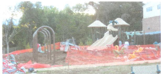
↑ Pieces of the playground puzzle are gradually being put together. "Twill look fine for kids from the Jacksonville area!"