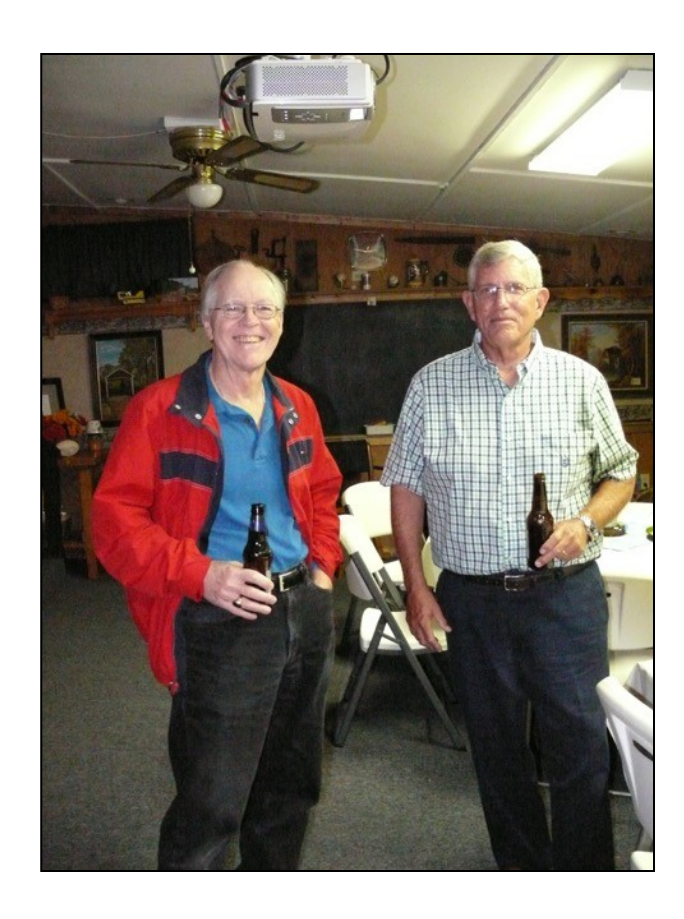
Bingo prizes and happily fed members!