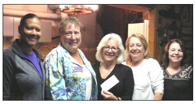
Ravens Roost 131 received $500 for their support of our Independence Day