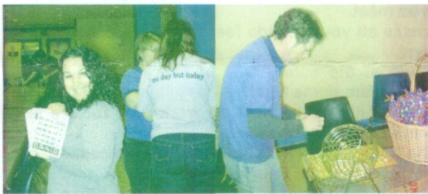
Bingo at Villa Maria —Greater Jacksonville Optimist Club members and Towson University Optimist Club members worked together as a team to provide bingo for about 50 kids at the Villa Maria School. Everyone had a super time! As the Villa Maria kids said— Optimists Rock!